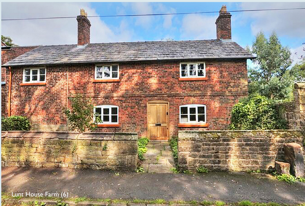
Lunt House Farm (6)

And the last group that culminates these vernacular buildings around 'Lunt Green' is Lunt Farm (9) which was built in 1936 to replace the older, probably 18th century. The only surviving building is the barn, also 18th-century, which is in a state of dereliction.