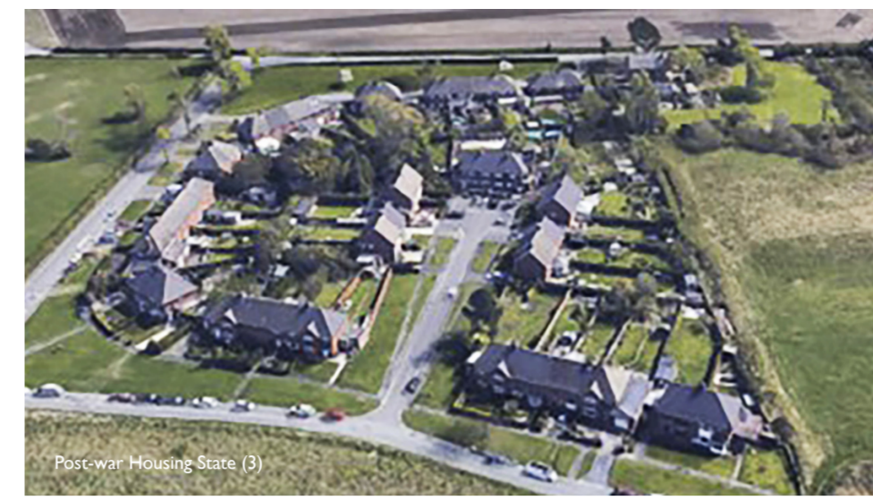
Post-war Housing State (3)

house people working on local farms. While there are some small differences (one pair has a datestone), most features are repeated.