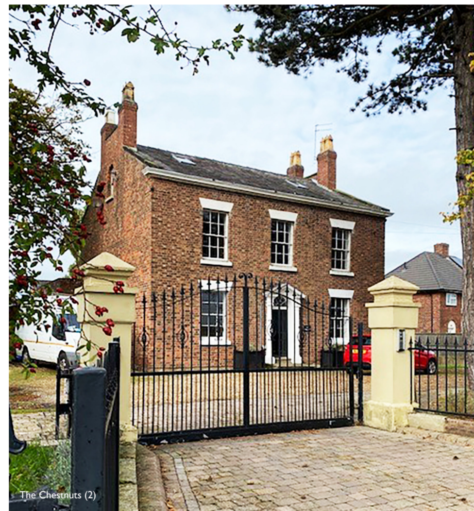
The Chestnuts (2)

Following Lunt Lane 'The Chestnuts' (2) can be found. Is designated as a grade II Listed Building and is the most distinctive building in the area due to its substantial size and unique architecture. Was built in the 18th