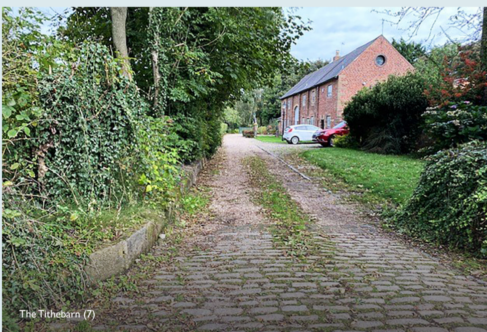
The Tithebarn (7)

The Tithebarn (7) also Grade II Listed and dating from 1693, was originally a barn used to store the tithes given by local parishioners to Sefton Church. When the barn fell into disuse it became home to Barney, a barn owl, until it was converted to residential use in the early 1980's.