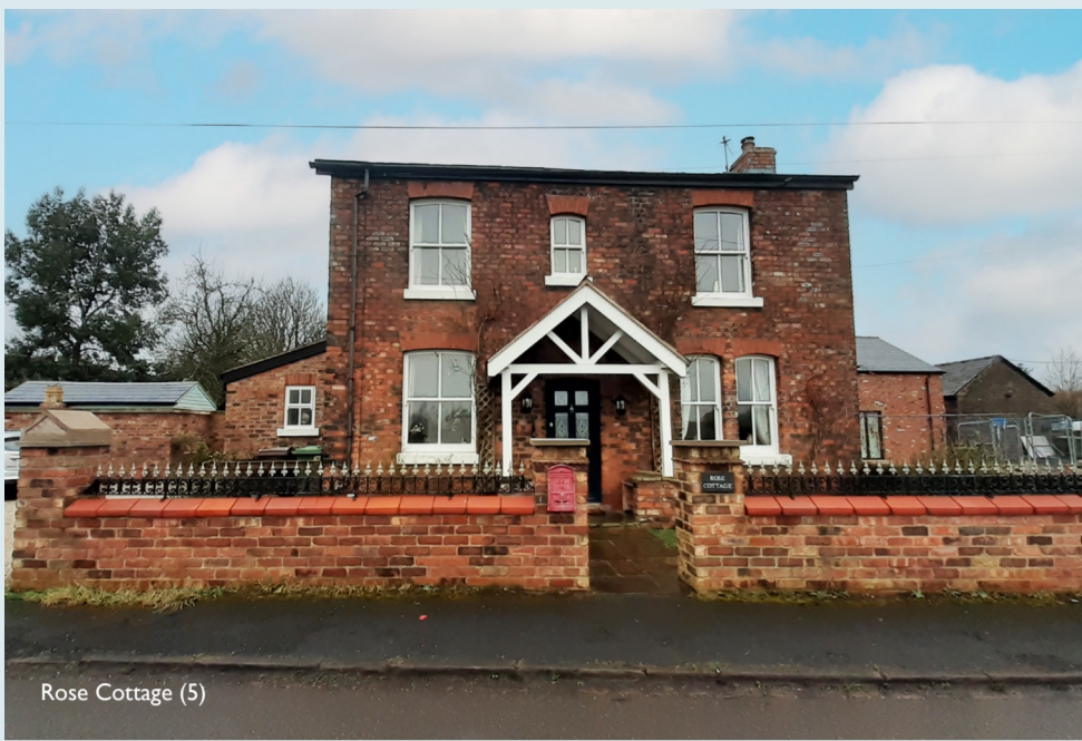
Rose Cottage (5)

The surviving buildings are of interest in that they represent a variety of vernacular styles through the full range of farm buildings. The group around 'Lunt Green' includes several vernacular buildings of historic interest. Rose Cottage (5) is one and the nearby Rose Farm has some working