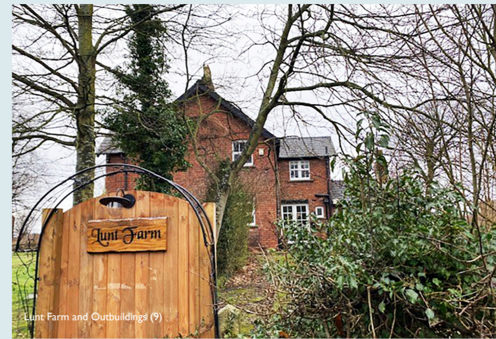
Lunt Farm and Outbuildings (9)

Pear Tree Cottage (8), although altered over time, dates from 1769.