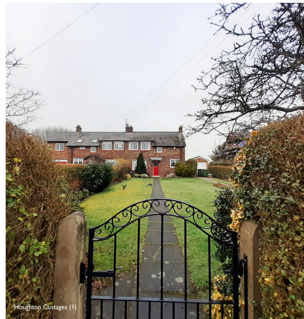
Houghton Cottages (1)

The 1769 estate plan of Sefton Manor (A) is the earliest map of the village. It shows a small group of buildings at a crossroads on the route between Ince Blundell and Sefton Church. The earlier 'tofts' and 'crofts' that made up the settlement have now disappeared, but it is still possible to trace the line of some of the 18th-century boundaries.