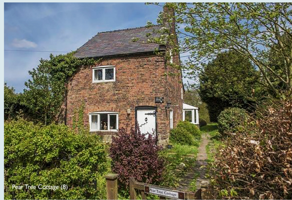
Pear Tree Cottage (8)

farm buildings alongside a mixture of modern and traditional structures in this area. Curtilages of buildings generally follow field patterns that are unchanged since at least as far back as 1769. Some buildings were recently transformed into residential use.