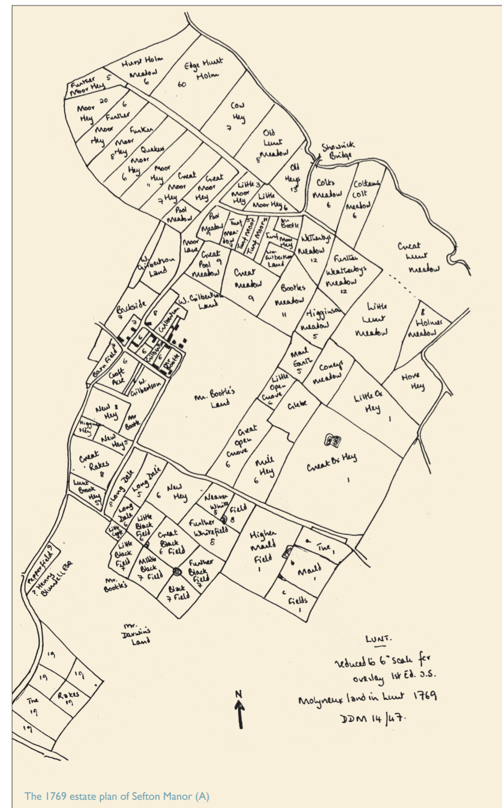
The 1769 estate plan of Sefton Manor (A)

There were a number of other buildings on Lunt Green associated with Lunt House, which have also disappeared. Lunt House had been