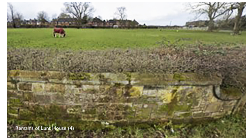
Remains of Lunt House (4)

of mediaeval predecessors and enclose a now open area referred to as 'Lunt Green' (the area to the north of the post-war housing estate). It is here that some tofts were established. The townscape around 'Lunt Green' is a mixture of 18th-century and more modern houses and farm buildings.